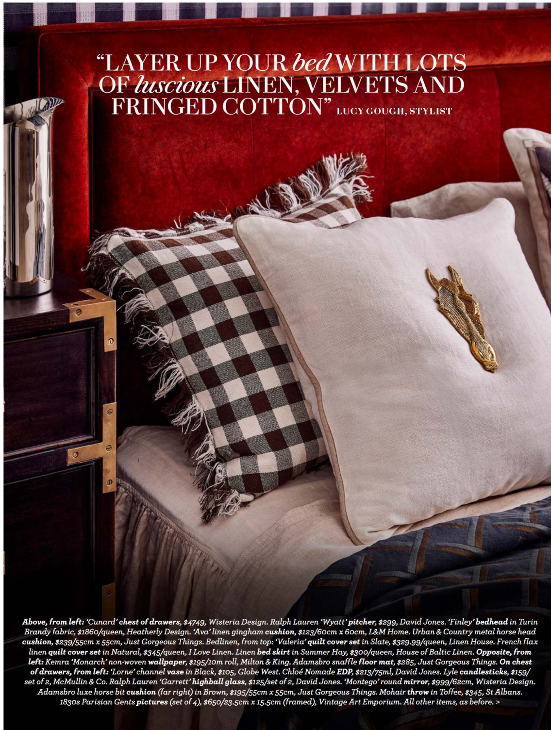
Above, from left: 'Cunard' chest of drawers, $4749, Wisteria Design. Ralph Lauren 'Wyatt' pitcher, $299, David Jones. 'Finley' bedhead in Turin Brandy fabric, $1860/queen, Heatherly Design. 'Ava' linen gingham cushion, $123/60cm x 60cm, L&M Home. Urban & Country metal horse head cushion, $239/55cm x 55cm, Just Gorgeous Things. Bedlinen, from top: 'Valeria' quilt cover set in Slate, $329.99/queen, Linen House. French flax linen quilt cover set in Natural, $345/queen, I Love Linen. Linen bed skirt in Summer Hay, $300/queen, House of Baltic Linen. Opposite, from left: Kemra 'Monarch' non-woven wallpaper, $195/10m roll, Milton & King. Adamsbro snaffle floor mat, $285, Just Gorgeous Things. On chest of drawers, from left: 'Lorne' channel vase in Black, $105, Globe West. Chloé Nomade EDP, $213/75ml, David Jones. Lyle candlesticks, $159/set of 2, McMullin & Co. Ralph Lauren 'Garrett' highball glass, $125/set of 2, David Jones. 'Montego' round mirror, $999/62cm, Wisteria Design. Adamsbro luxe horse bit cushion (far right) in Brown, $195/55cm x 55cm, Just Gorgeous Things. Mohair throw in Toffee, $345, St Albans. 1830s Parisian Gents pictures (set of 4), $650/23.5cm x 15.5cm (framed), Vintage Art Emporium. All other items, as before. >