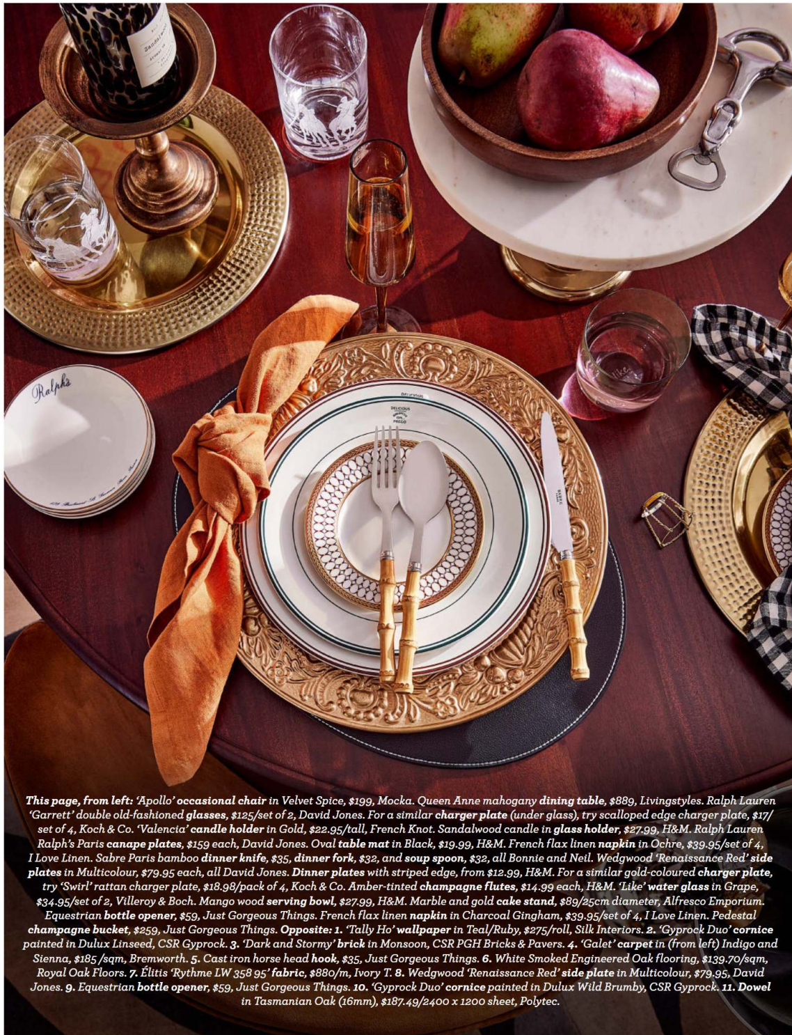
This page, from left: 'Apollo' occasional chair in Velvet Spice, $199, Mokka. Queen Anne mahogany dining table, $889, Livingstyles. Ralph Lauren 'Garrett' double old-fashioned glasses, $125/set of 2, David Jones. For a similar charger plate (under glass), try scalloped edge charger plate, $17/set of 4, Koch & Co. 'Valencia' candle holder in Gold, $22.95/tall, French Knot. Sandalwood candle in glass holder, $27.99, H&M. Ralph Lauren Ralph's Paris canape plates, $159 each, David Jones. Oval table mat in Black, $19.99, H&M. French flax linen napkin in Ochre, $39.95/set of 4, I Love Linen. Sabre Paris bamboo dinner knife, $35, dinner fork, $32, and soup spoon, $32, all Bonnite and Neil. Wedgwood 'Renaissance Red' side plates in Multicolour, $79.95 each, all David Jones. Dinner plates with striped edge, from $12.99, H&M. For a similar gold-coloured charger plate, try 'Swirl' rattan charger plate, $18.98/pack of 4, Koch & Co. Amber-tinted champagne flutes, $14.99 each, H&M. 'Like' water glass in Grape, $34.95/set of 2, Villeroy & Boch. Mango wood serving bowl, $27.99, H&M. Marble and gold cake stand, $89/25cm diameter, Alfresco Emporium. Equestrian bottle opener, $59, Just Gorgeous Things. French flax linen napkin in Charcoal Gingham, $39.95/set of 4, I Love Linen. Pedestal champagne bucket, $259, Just Gorgeous Things. Opposite: 1. 'Tally Ho' wallpaper in Teal/Ruby, $275/roll, Silk Interiors. 2. 'Gyprock Duo' cornice painted in Dulux Linseed, CSR Gyprock. 3. 'Dark and Stormy' brick in Monsoon, CSR PGH Bricks & Pavers. 4. 'Galet' carpet in (from left) Indigo and Stenna, $185/sqm, Bremworth. 5. Cast iron horse head hook, $35, Just Gorgeous Things. 6. White Smoked Engineered Oak flooring, $139.70/sqm, Royal Oak Floors. 7. Elitis 'Rythme LW 358 95' fabric, $880/m, Ivory T. 8. Wedgwood 'Renaissance Red' side plate in Multicolour, $79.95, David Jones. 9. Equestrian bottle opener, $59, Just Gorgeous Things. 10. 'Gyprock Duo' cornice painted in Dulux Wild Brumby, CSR Gyprock. 11. Dowel in Tasmanian Oak (16mm), $187.49/2400 x 1200 sheet, Polytec.

09 Oct 2023 Author: Lucy Gough Article type: Publication Page: Home Beautiful Readership: 320000 AVE: $75479.17